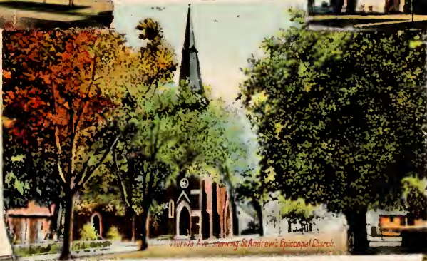
Flourish Ave. showing St Andrew's Episcopal Church.